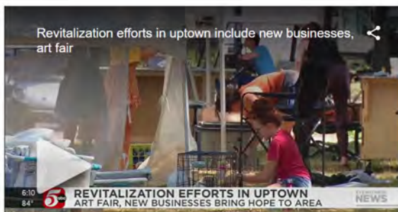
Over 15 Television News Stories featured the 2022 Uptown Art Fair

Alex Jankich KSTP Updated: August 4, 2022 - 11:00 PM Published: August 4, 2022 - 6:49 PM